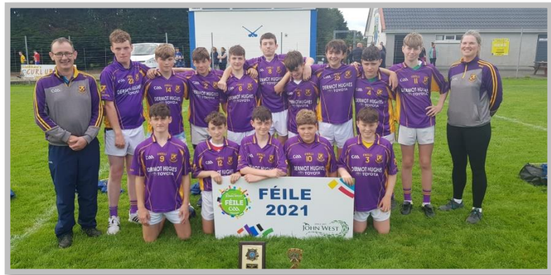
Under 15 Team who took part in Féile.

respect, they held for each other in their own way. That comes from home.