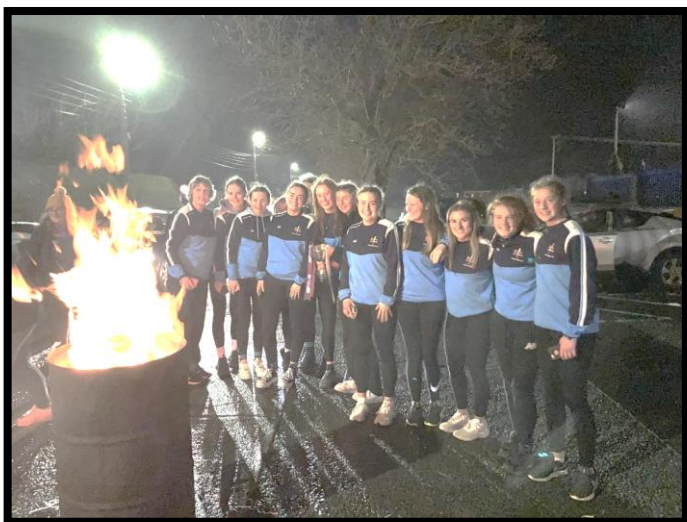
Celebrations at the Hyde for the returning All Ireland Champions returning to town.