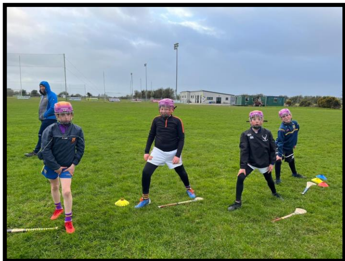
Our Under 11's stretching back into sessions.

Training continues on Wednesdays & alternative Sundays with plenty of matches to look forward to in coming weeks.