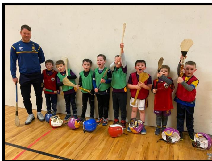
Pictured Above: First Day Back and lots of smiles for our Under 7 Hurling stars.