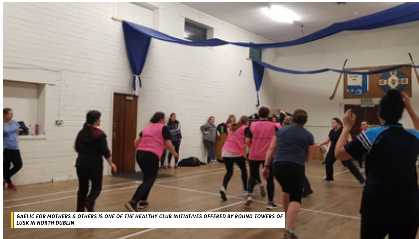
GAAELIC FOR MOTHERS & OTHERS IS ONE OF THE HEALTHY CLUB INITIATIVES OFFERED BY ROUND TOWERS OF LUSK IN NORTH DUBLIN