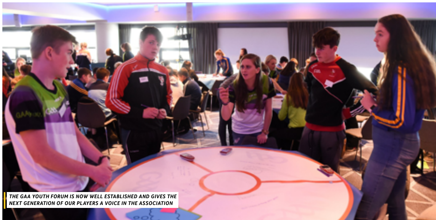
THE GAA YOUTH FORUM IS NOW WELL ESTABLISHED AND GIVES THE NEXT GENERATION OF OUR PLAYERS A VOICE IN THE ASSOCIATION