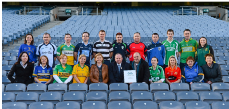
DELEGATES REPRESENTING THE 18 CLUBS THAT PARTICIPATED IN PHASE 1 OF THE HEALTHY CLUB PROJECT IN 2014. REFLECTING THE ENORMOUS GROWTH IN INTEREST IN THE PROJECT, 300 DELEGATES REPRESENTING 150 CLUBS ATTENDED THE 2020 NATIONAL ORIENTATION DAY IN CROKE PARK ON FEBRUARY 1ST THAT MARKED THE START OF PHASE 4.

The Challenge starts on March 16th and ends on 12th April 2020.